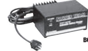
RB12V – Battery only. BP12INT – Battery with cord and carrying case. Wt., 5 kg. RC12V – Replacement 1,2 m battery cord only. Wt., 0,2 kg.