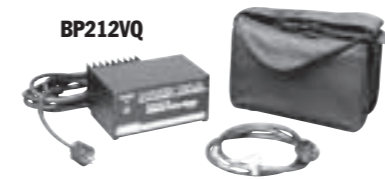
BP212VQ – Optional 12 volt battery pack. Includes sealed lead acid battery, 115V charger, 1,2 m cord, carrying case and shoulder strap. Wt., 8 kg.