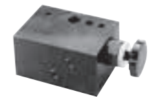
9560 – Pressure regulator. Adjustable from 70 to 700 bar. All mounting hardware included. Wt., 1,4 kg.

NOTE: Amp draw at 700 bar; 6 amp at 115 volt, 3 amp at 230 volt, and 35 amp at 12 volt.