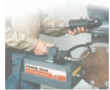
The Quarter Horse pump has a maximum operating pressure of 700 bar, which handles a wide variety of hand held hydraulic tools.