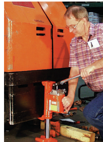
The J Series Toe Jack is an extremely rugged jack used here for lift truck service.